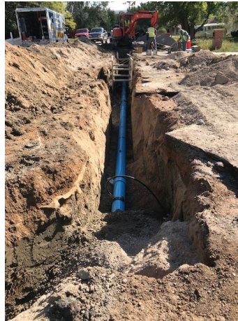
WATER MAIN REPLACEMENT

With much of our infrastructure reaching the end of its life expectancy, the District plans to replace up to 2,000 feet of water main each year. This equates to about 2% of our water system per year. At this rate, our entire water system will be replaced within 50 years. By focusing on replacing our most vulnerable (and corroded) pipes first, we will be reducing the number of water main breaks considerably. This will help offset the costs for these replacement projects. This year, the District replaced over 1,700 feet of water main.